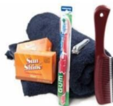
Personal Care Kits

list of bulk items available on Amazon and a Walmart shopping list. It doesn't need to be these exact items, but this is just a sample of cost-effective supplies. If you are interested in purchasing a bulk order of something, let us know at the church office. This will help us from having an overabundance of any one item! Pick up a list at church by the Mission Kit drop off shelf.