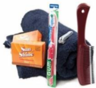
Personal Care Kits

Personal Care Kits: a light towel wrapped with basic hygiene items.